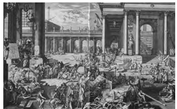
Académie des Sciences 1698 , engraving