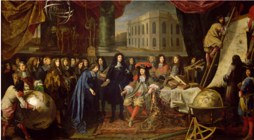
Colbert Presenting the Members of the Royal Academy of Sciences to Louis XIV in 1667 by Henri Testelin